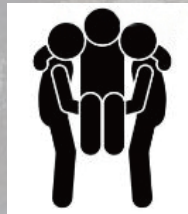
Move Casualty in Sitting Position