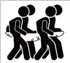
Move Casualty by Side Carrying