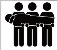
Move Casualty in Confined Area