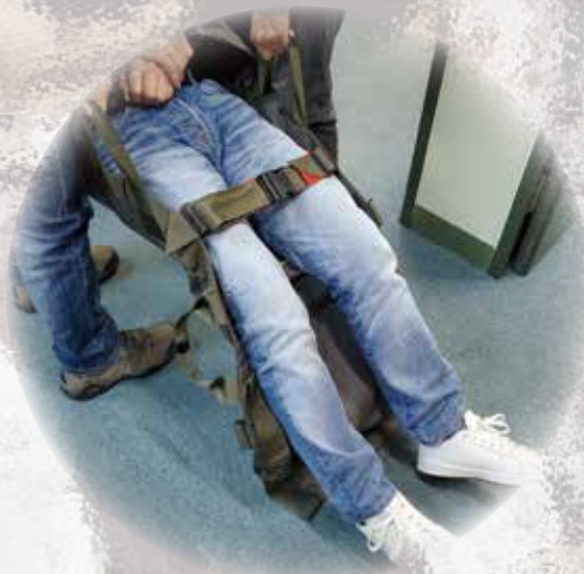
HALF BED (SITTING POSITION) HANDLE METHOD